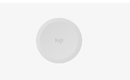
Share Button Scribe button in white. Purple button is included with Scribe.